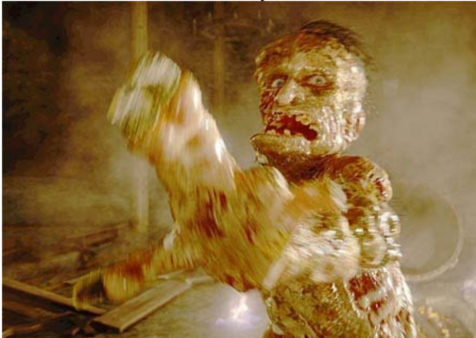
Grendel- a face only a mother could love.

So mankind's enemy continued his crimes, Killing as often as he could, coming Alone, bloodthirsty and horrible. Though he lived In Herot, when the night hid him, he never Dared to touch king Hrothgar's glorious Throne, protected by God—God, Whose love Grendel could not know. But Hrothgar's Heart was bent. The best and most noble Of his council debated remedies, sat In secret sessions, talking of terror And wondering what the bravest of warriors could do. And sometimes they sacrificed to the old stone gods, Made heathen vows, hoping for Hell's Support, the Devil's guidance in driving Their affliction off. That was their way, And the heathen's only hope, Hell Always in their hearts, knowing neither God Nor His passing as He walks through our world, the Lord Of Heaven and earth; their ears could not hear His praise nor know His glory. Let them Beware, those who are thrust into danger, Clutched at by trouble, yet can carry no solace In their hearts, cannot hope to be better! Hail To those who will rise to God, drop off Their dead bodies and seek our Father's peace!